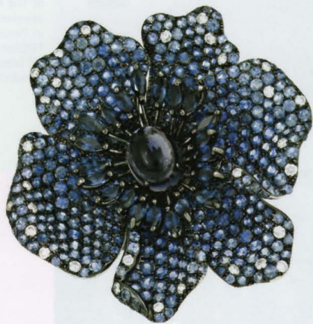
Bloom Blue Sapphire and Diamond Ring, Jardin Collection (Effy, $3,295)