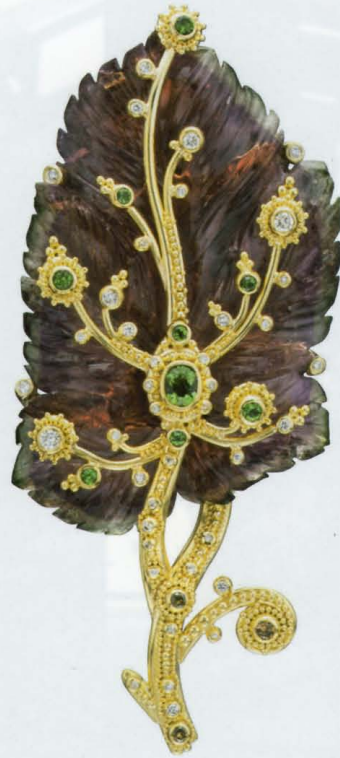
Coral Bells Pin with Chrome Tourmalines & Diamonds (Zaffiro, $39,000)