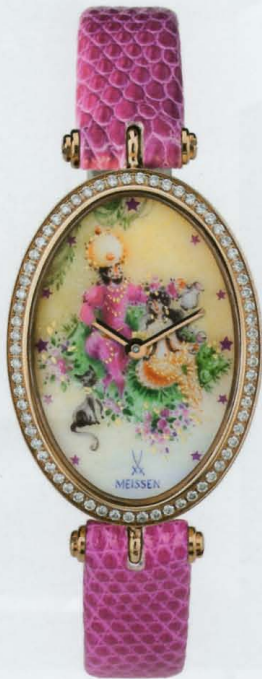
Arabian Nights "Flying Carpet Timepiece" (Meissen Joaillerie)