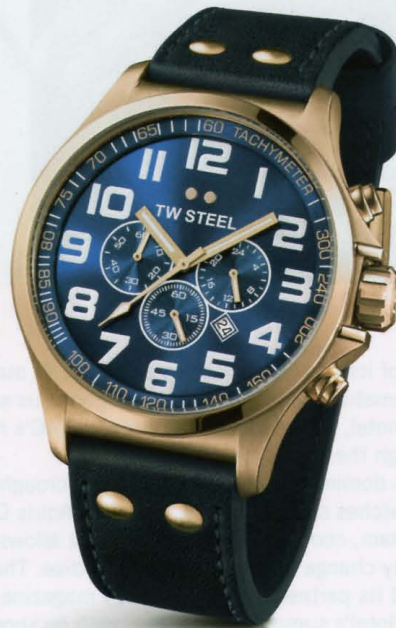
45mm Chronograph Miyota OS20 movement, Pilot Collection (TW Steel, $499)