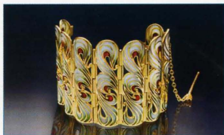
Leila Tai Foliage Bracelet 18k gold, Burma rubies, enamel www.leilataidesign.com