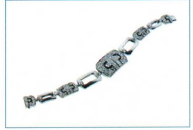
Bulgari Parentesi Bracelet 18k white gold, white diamonds www.bulgari.com

"Jewelry is one of fashion's most enduring statements and a true expression of personal style." —Saks Fifth Avenue