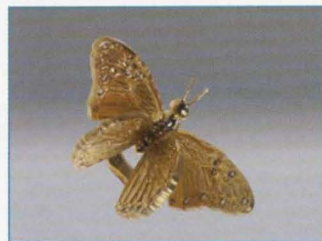
Elyssa Bass Butterfly Ring 18k gold, chocolate diamonds www.elyssabassdesigns.com