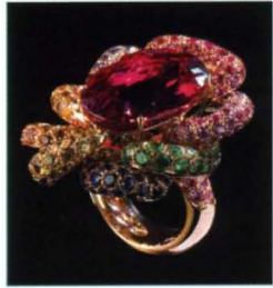
Giorgio Armani Rockstar Ring Red gold, rubellite, colored sapphires, tsavorite www.giorgioarmani.com