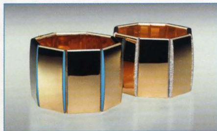
Vhernier Bridge Bracelets Rose gold, turquoise, white diamonds www.vhernier.com