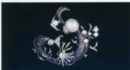
Lorenz Bäumer Moray Eel Brooch Purple sapphires, Australian pearls, freshwater pearls, white diamonds, white gold www.lorenzbaumer.com