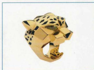
Cartier Tête de Panthère Ring Yellow gold, black lacquered spots, onyx, peridot www.cartier.com