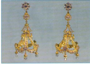
Cynthia Bach Chandelier Earrings 18k gold, white diamonds www.cynthiabach.com