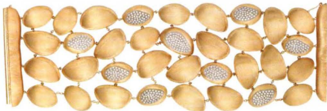
Marco Bicego Confetti Collection Bracelet 18k gold, white diamonds www.marcobicego.com

"I like to ornament myself with beautiful jewelry, and I also like jewelry as a decorative object just to collect and look at." —Beth Rudin DeWoody