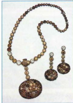
Roberto Coin Meteorite Parure 18k white gold, cognac diamonds, champagne diamonds, white diamonds www.robortocoin.com