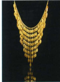
Gurhan Willow Necklace 24k gold www.gurhan.com