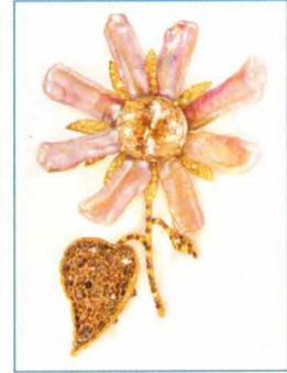
Adria de Haume Sunflower Brooch Yellow tourmaline, freshwater stick pearls, canary diamonds, cognac diamonds www.haume.com