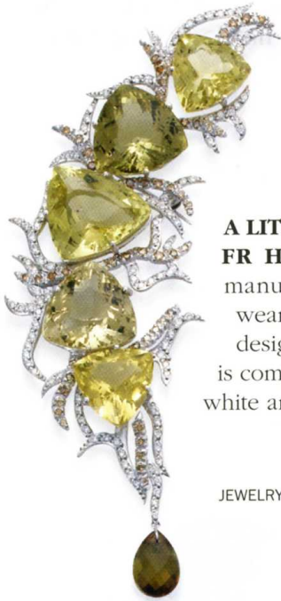
JEWELRY BY FR HUEB

FR Hueb is a Brazilian jewelry manufacturing enterprise creating wearable art. This luxurious brooch design, from the Luxury Collection , is composed of white gold, beryl and white and brown diamonds.