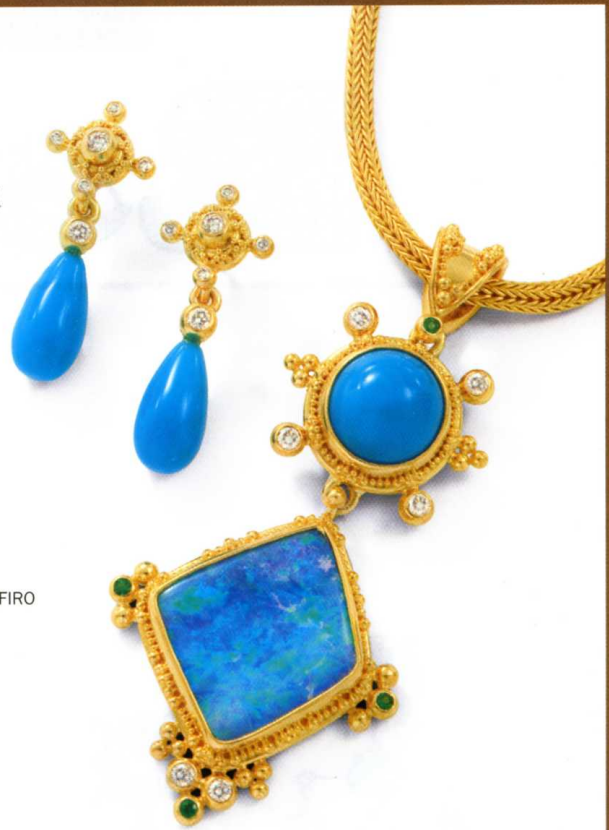
JEWELRY BY ZAFFIRO

Although it's called the Classic Collection Ensemble , there's nothing old fashioned about the materials used in this line from Zaffiro . The earrings are set with 10.95 carats of natural Persian turquoise briolettes, 0.39 carats of diamonds in granulated 22 karat yellow gold with 18 karat yellow gold posts. The gold pendant is set with 8.45 carats of natural Persian turquoise, Australian boulder opal weighing 19.06 carats, 0.39 carats of diamonds and 0.14 carats of tsavorite garnets.