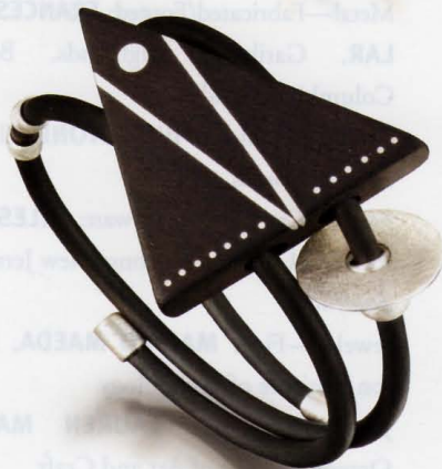
Silver ◀ SUZANNE LINQUIST Junction City, Oregon